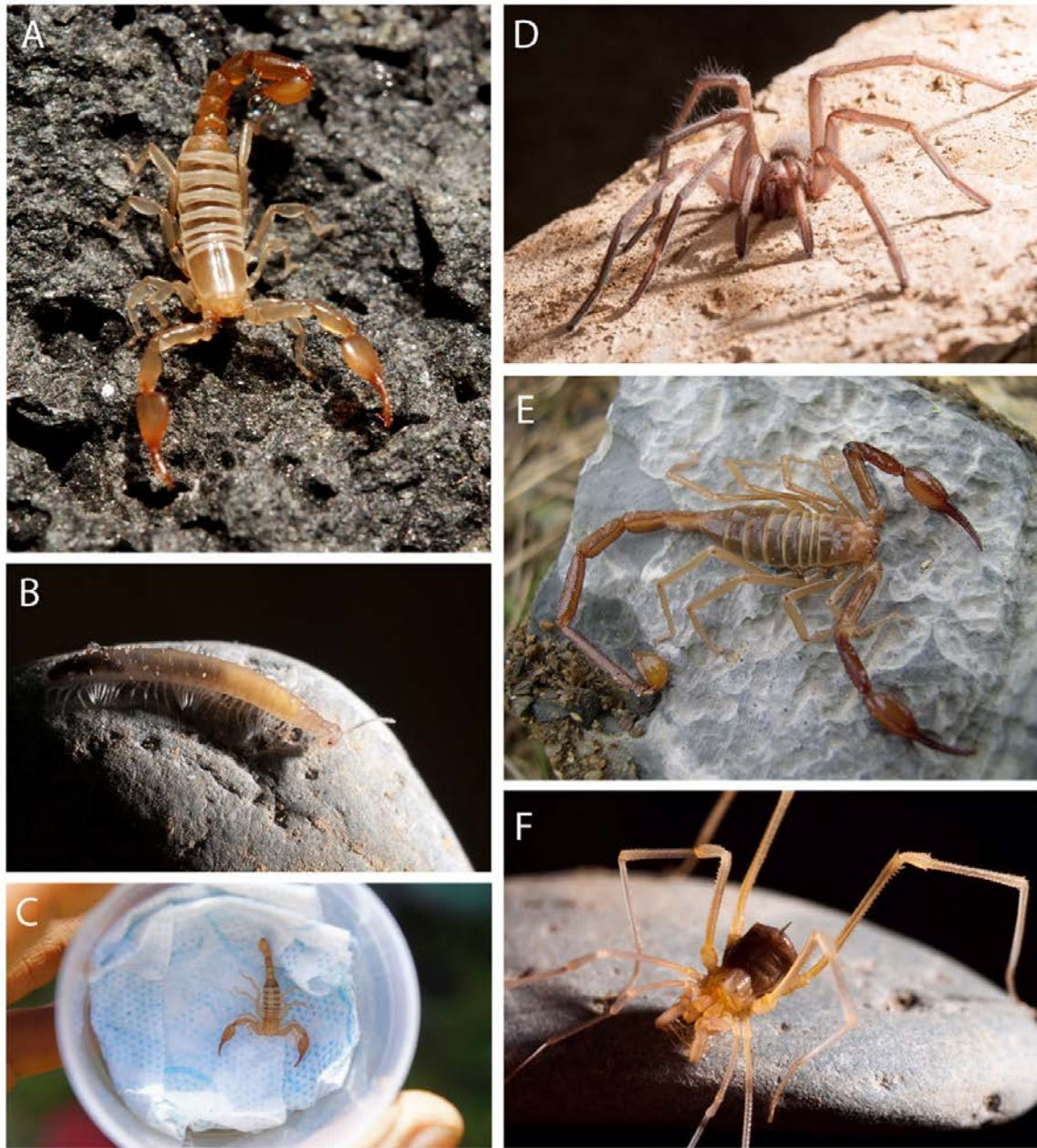
Figure 3. Troglobiont fauna of Sistema Huautla. (A) Typhlochactas sp., (B) Sphaeriodesmus iglesia Shear, 1986, (C) Typhlochactas sp. collecting method, (D) Hemirrhagus grieta Gertsch, 1982, (E) Alacran tartarus Francke, 1982, (F) Minisge sagai Cruz-López et al. 2019.

Another remarkable species inhabiting the Huautla System is an undescribed species of an undescribed genus of the subfamily Gagrellinae (Eupnoi: Sclerosomatidae), which seems to be closely related to Parageaya Mello-Leitão, 1933, but currently, only considered as a member of Gagrellinae with troglomorphic features such as body pale color. Other record of troglomorphic species in the system is an undescribed Stygnomma Roewer, 1912. However, since the revision of Stygnommatidae by Pérez-González (2009) [28], Stygnomma was recognized as a polyphyletic assemblage, with the fauna of southern Mexico belonging in fact to members to the family Biantidae, but, unfortunately, a taxonomic act has not yet been formalized for this group.