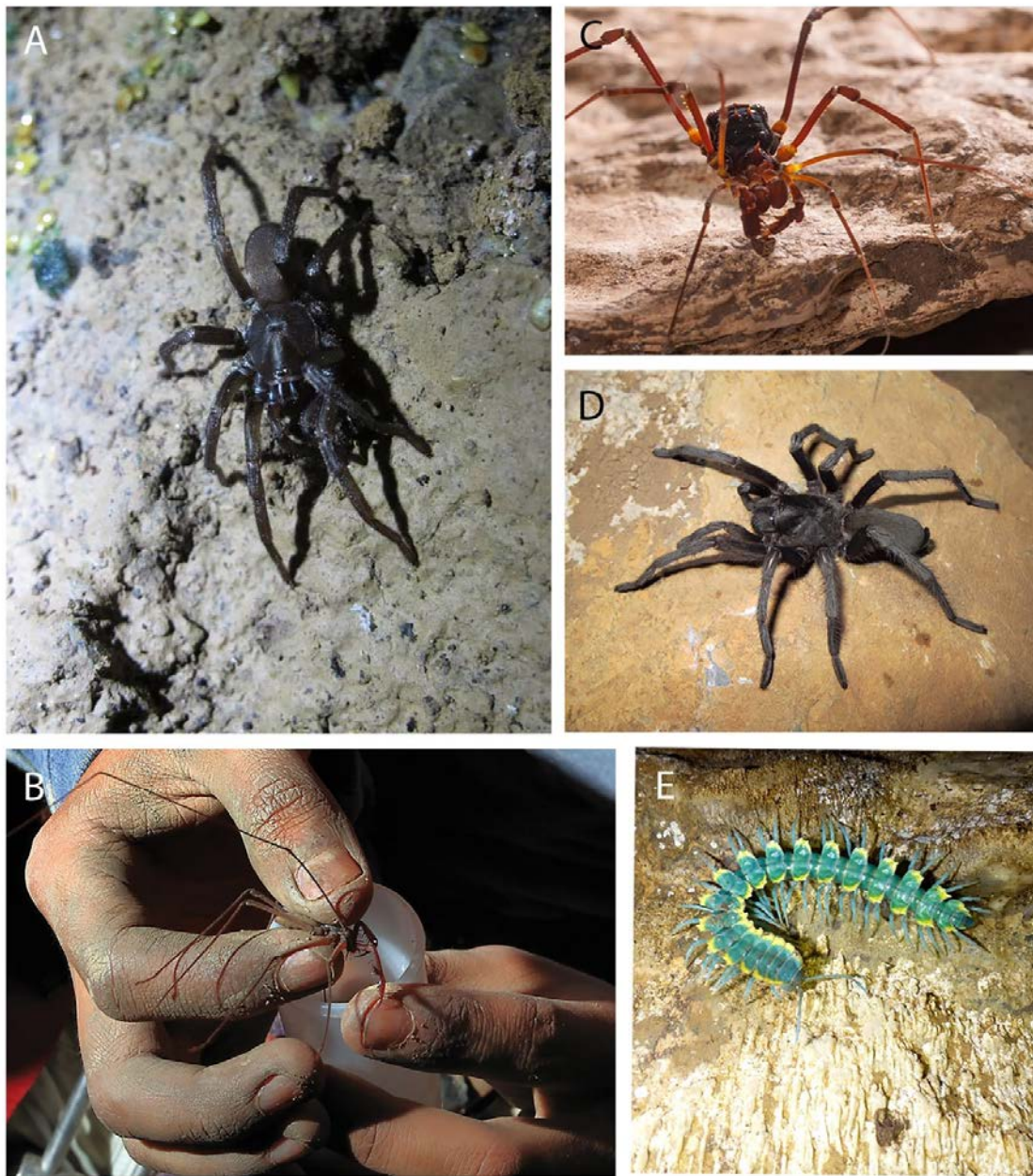
Figure 2. Troglobiont fauna of Sistema Huautla. (A) Hemirrhagus sp., (B) Paraphrynus grubbsi Cokendolpher and Sissom, 2001, (C) Stygnopsis sp., (D) Hemirrhagus billstelei Mendoza and Francke, 2018, (E) Rhachodesmus digitatus Causey, 1971. Photos by Jean Krejca, Figure (D) taken and modified from Mendoza and Francke, 2018.